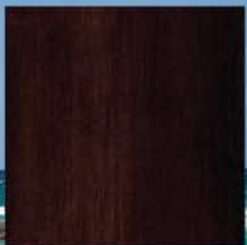
Bora - Bora DI812BB