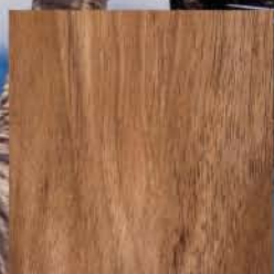
St. Lucia DI801SL