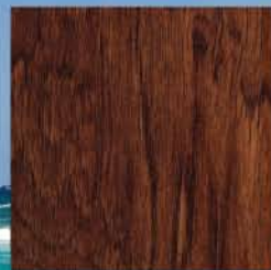
Great Palm DI815GP