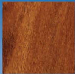
St. Thomas DI806ST