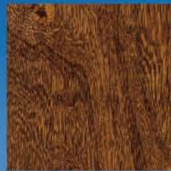
St. Barts DI809SB