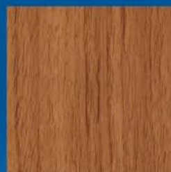
St. Vincent DI804SV