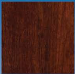
Grand Bahama DI807GB