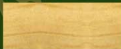
Finished Natural Oak